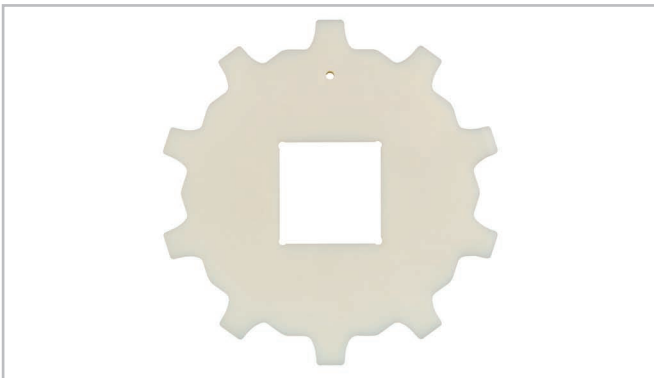
Sprocket one-piece (solid)

For a 100 mm wide belt double-row sprockets are recommended.