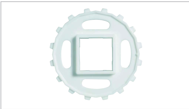
Sprocket one-piece ("open window")