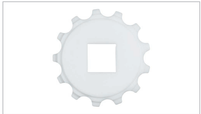
Sprocket one-piece (solid)