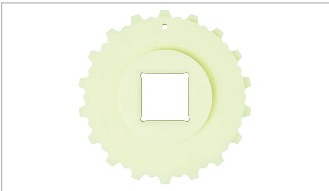
Sprocket one-piece (solid)