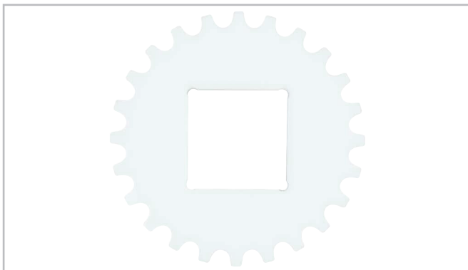
Sprocket one-piece (solid)